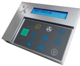
CONTROL PANEL TYPE BE-LCD