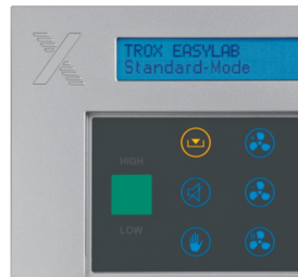
DISPLAY, FUNCTION BUTTONS WITH STATUS DISPLAY